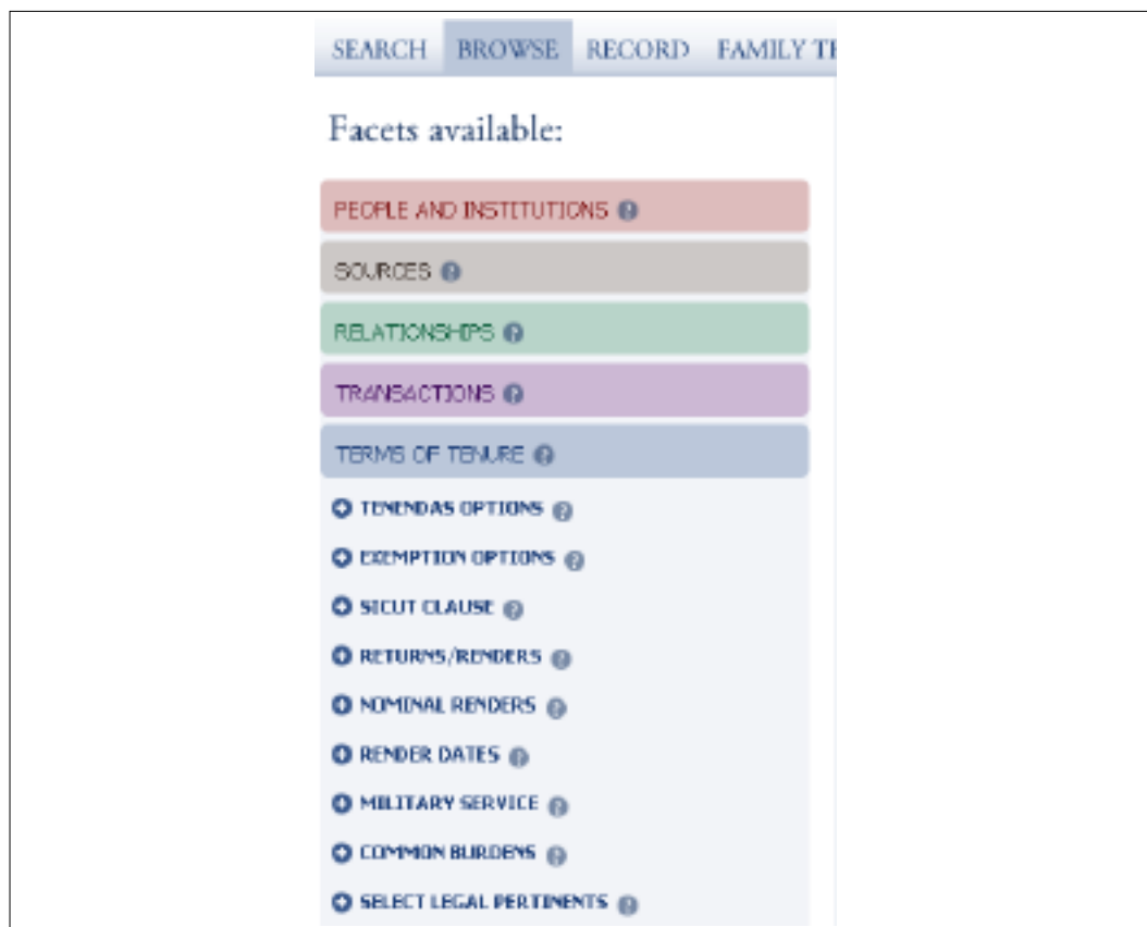
Figure 7 Examples of searchable terms of tenure

While this may hinder more investigative research on the localities of medieval Scotland through the PoMS database, the wealth of information on people and society that is available should facilitate other independent studies in this area and allow users a starting point from which to begin their research.